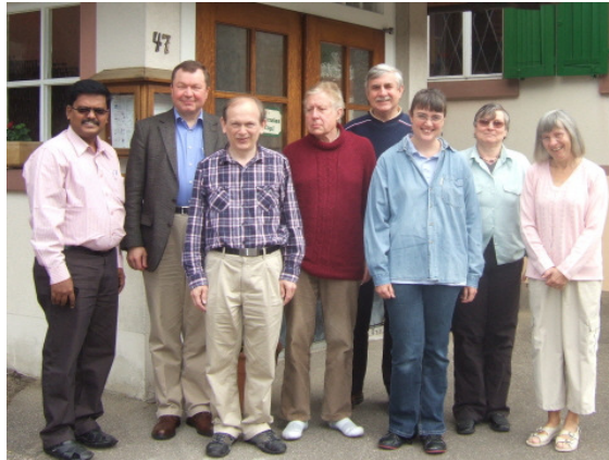
Martin Luther's doctrine fed our souls