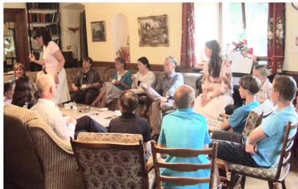
Coffee time after a Sunday service